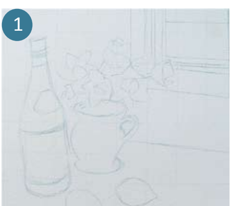
Using Deep Indigo sketch the initial outline onto your paper.