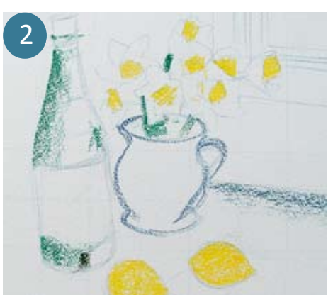
Using Field Green, Sun Yellow and Bright Blue loosely lay basic colours down on certain parts of the drawing.