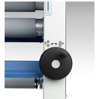
Manual nip adjustment with height gauge for precise operation.