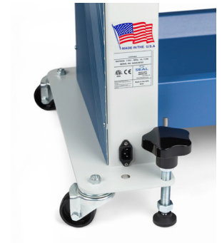
Optional heavy duty rear stabilizing feet.