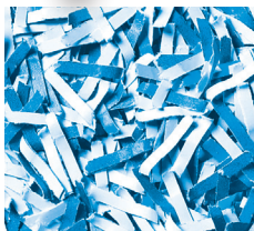
Level P-5 Micro-Cut