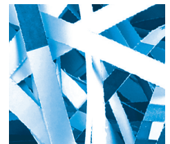
Level P-2 Strip-Cut