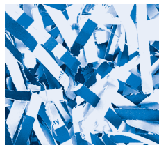
Level P-4 Super Cross-Cut