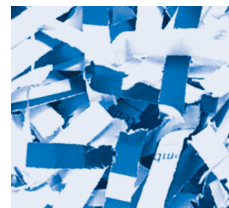
Level P-3 Cross-Cut